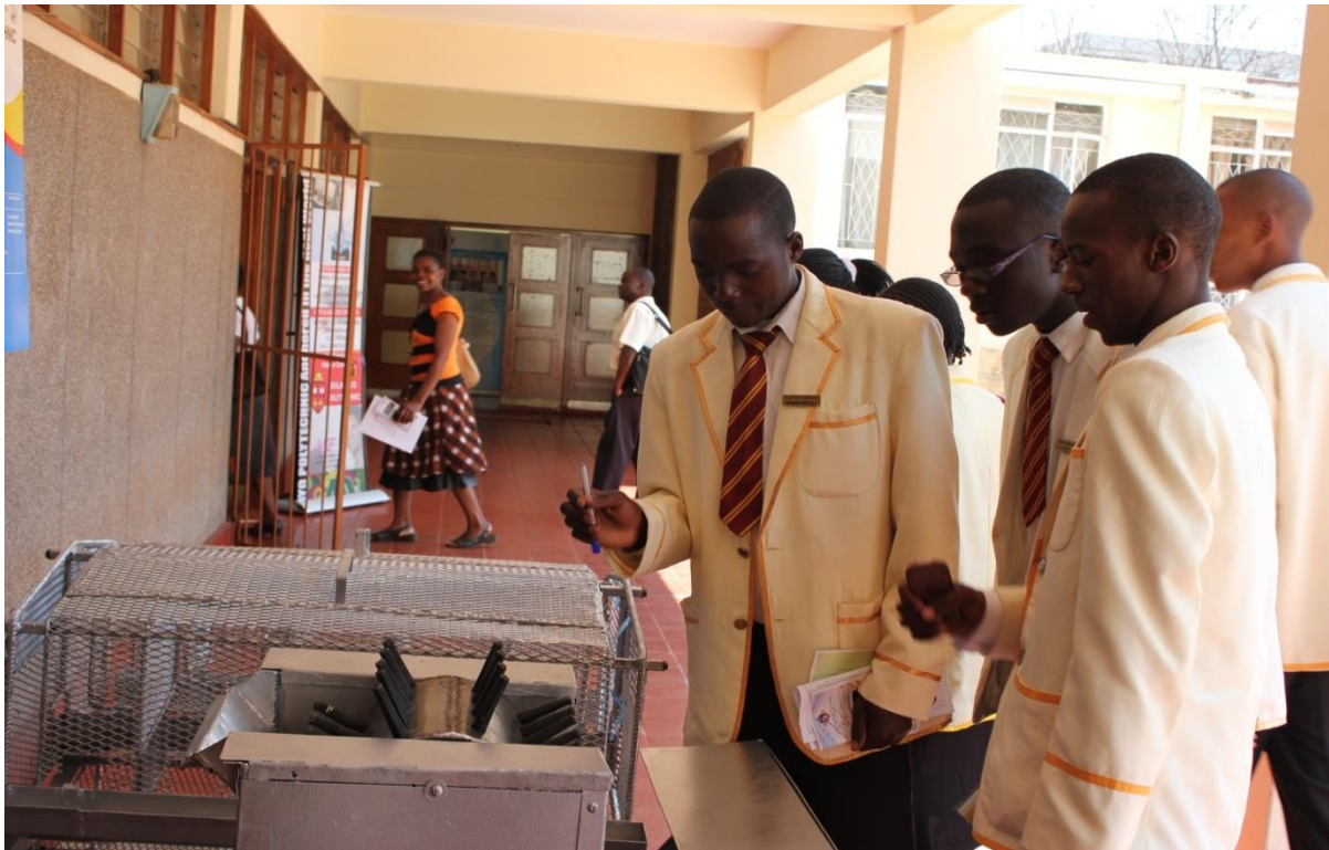
Figure 3: High schools students going through the exhibits