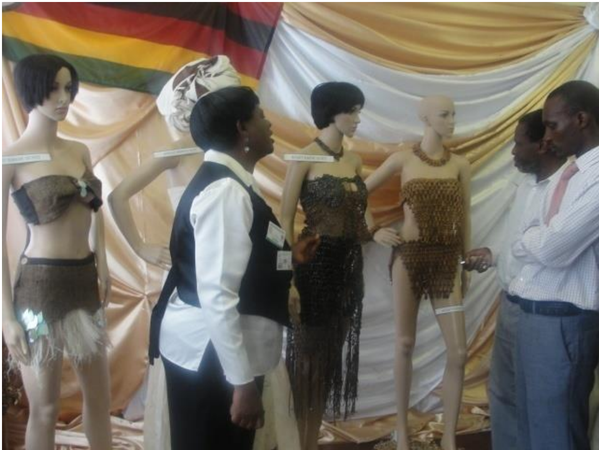
Figure 1: Bulawayo Polytechnic showcasing research in traditional fashion at RIE 2011